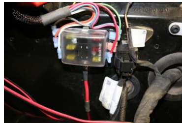
Mount Fuse Box

STEP 3 Mount Fuse box on fire wall near factory barrier strip as seen above.