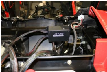
Mount Control Box

STEP 2 Mount the power control unit on the cross bar under the dash with included self tapping screws