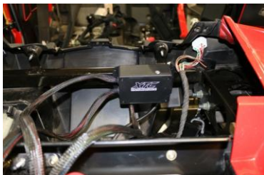
Mount Control Box

STEP 2 Mount the power control unit on the cross bar under the dash with included self tapping screws